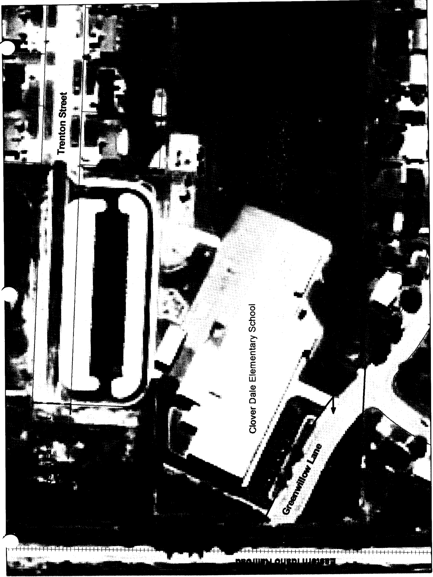
Proposed Greenwillow Lane Vacation